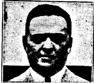
J. EDGAR HOOVER Target of Accusations

That's what happened to the Lindberghs... Did any of us ever imagine Lindbergh and Anne would be hissed in newsreel theaters?... And if G-man Hoover decides to use 150 of his agents to trap the fiend—and if he uses tear gas bombs and machine guns—there will be some fools who will come out in their editorials and columns and accuse the G-men of "showing